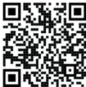
Giving QR Code