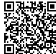
Prayer Card QR Code